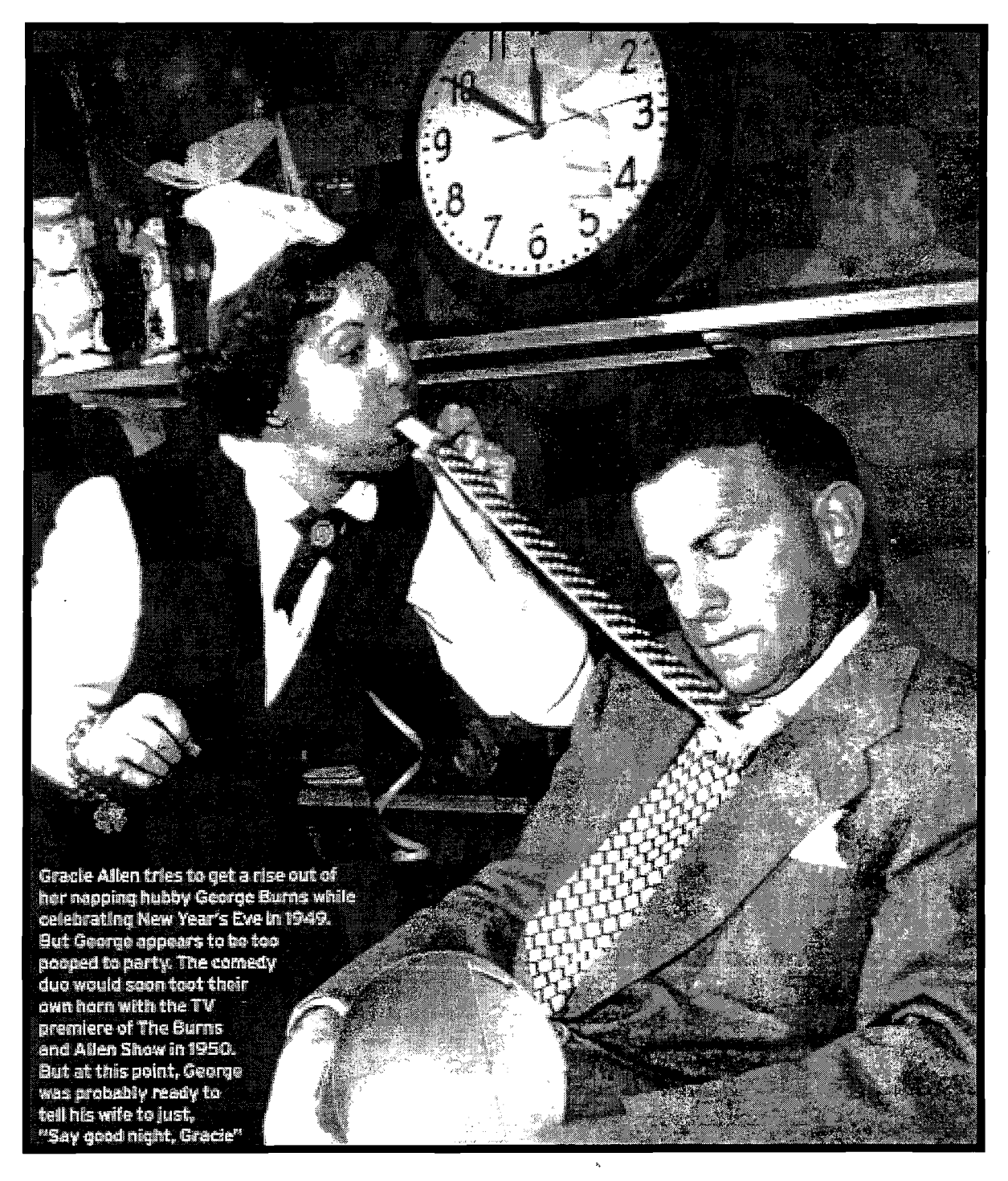
Welcome to a New Year in The Old Time Radio Club

The Old Time Radio Club Established 1975 The Old Time Radio Club February 2004